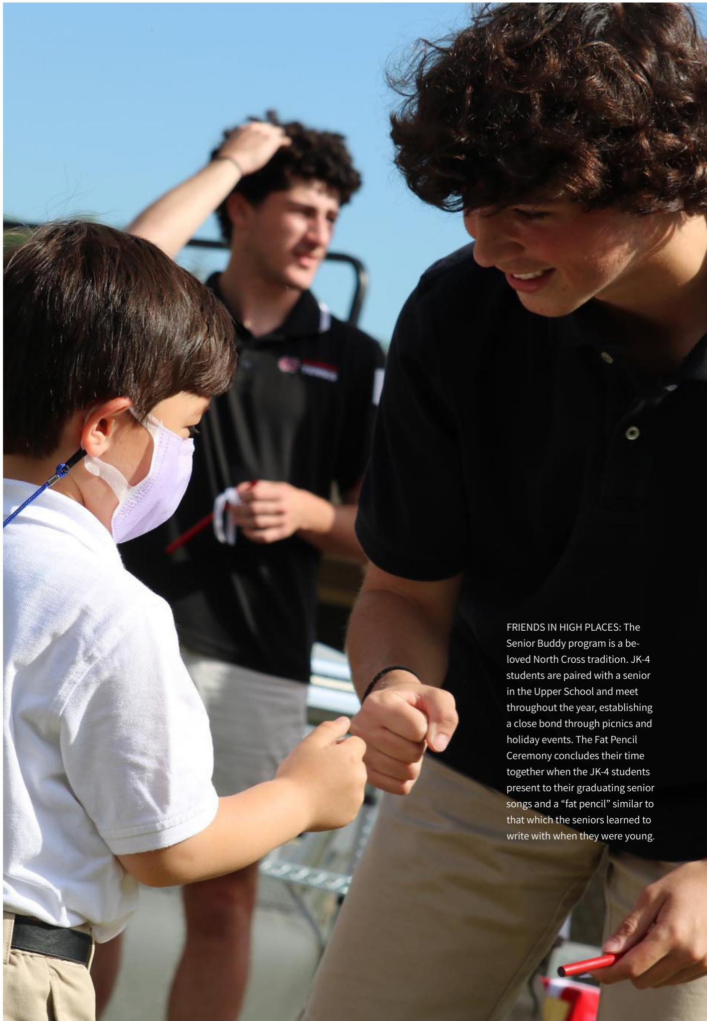
FRIENDS IN HIGH PLACES: The Senior Buddy program is a beloved North Cross tradition. JK-4 students are paired with a senior in the Upper School and meet throughout the year, establishing a close bond through picnics and holiday events. The Fat Pencil Ceremony concludes their time together when the JK-4 students present to their graduating senior songs and a “fat pencil” similar to that which the seniors learned to write with when they were young.